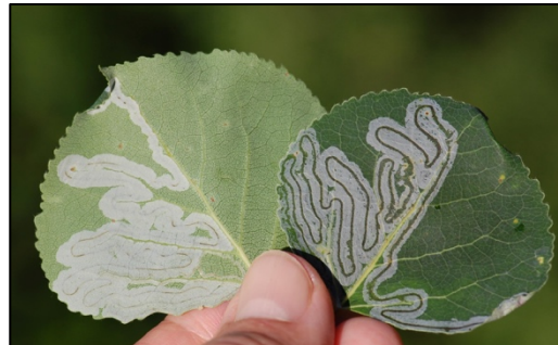
Leaf miner trails on the front (right) and back (left) of aspen leaves.

To test their idea, Jenifer and Diane set up an experiment on the University of Alaska campus in Fairbanks. Jenifer and Diane let leaf miners lay eggs on leaves, like normal. Each caterpillar is so small that it stays on a single leaf side to eat. Jenifer and Diane removed eggs and marked about 10 leaves on each of 14 aspen trees. They randomly assigned each leaf to one of three treatments by removing the leaf miner eggs from either the top, bottom, or both sides of the leaves. To remove eggs from leaves, they wore magnifying headsets, just as a jeweler might wear, and carefully scraped each tiny egg off the leaf using a sharp probe. By doing so, they had leaves that were 1) mined on the bottom surface only, 2) mined on the top surface only, and 3) unmined (control) leaves.