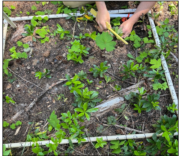
Plots in 2023 being surveyed for native and invasive plants to calculate the proportion that are invasive after a burn.