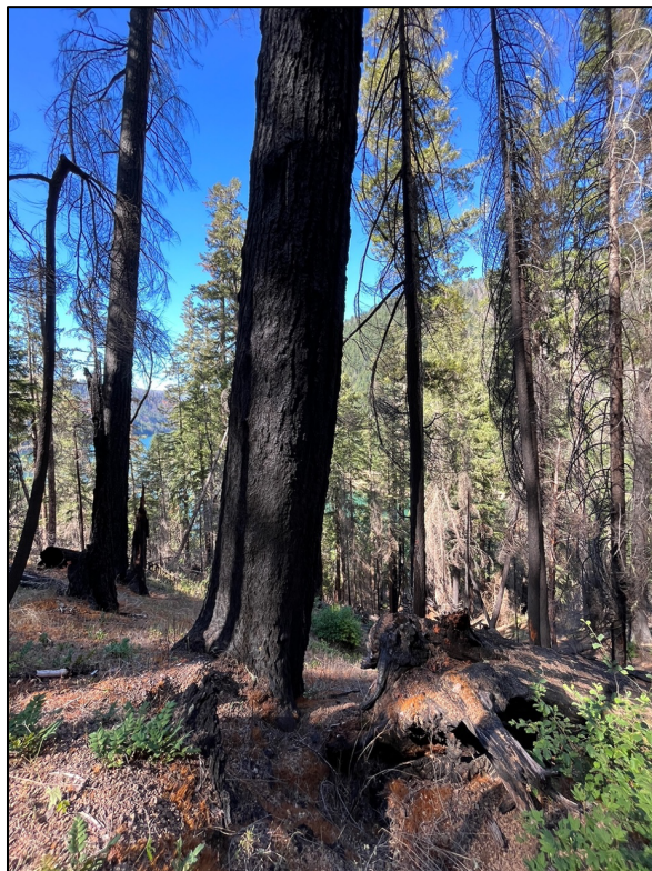
Area of the H.J. Andrews Experimental Forest in Oregon, a few years after a fire.