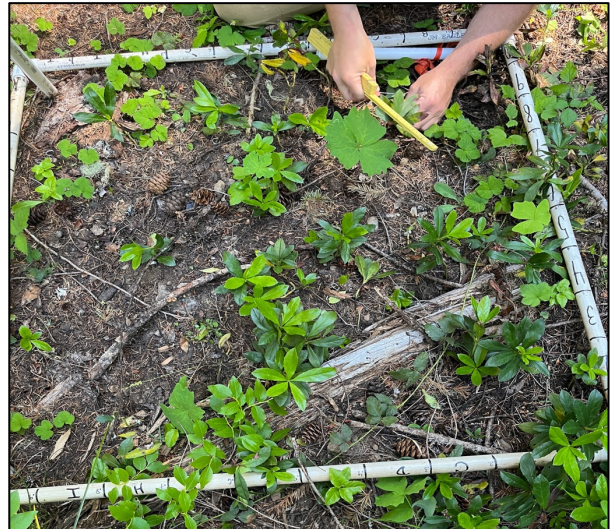
Plots in 2023 being surveyed for native and invasive plants to calculate the proportion that are invasive after a burn.