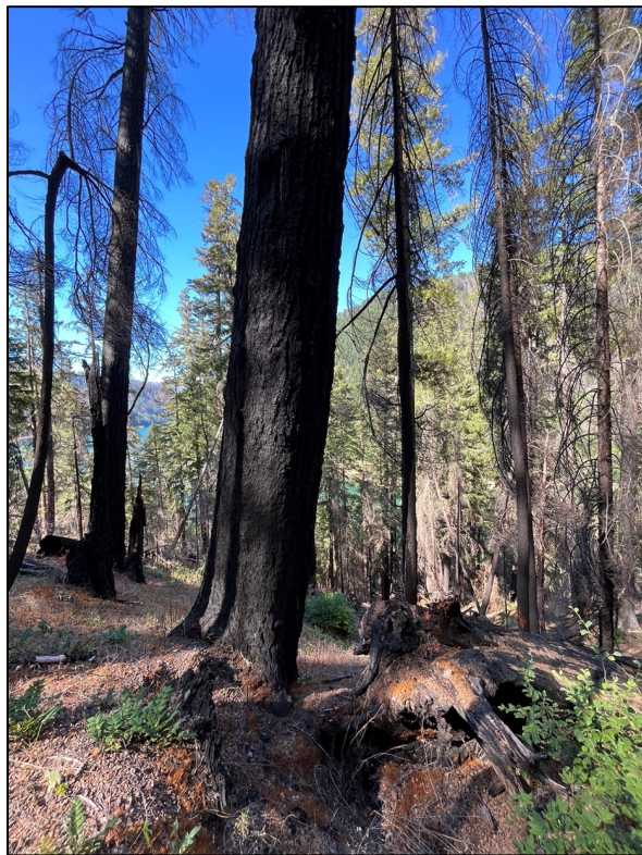
Area of the H.J. Andrews Experimental Forest in Oregon, a few years after a fire.