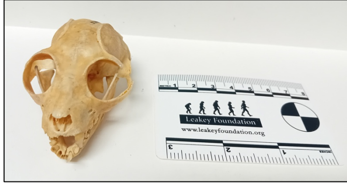
The skull of Perodicticus potto .

Holly and her colleagues wanted to know whether Mioeuoticus were nocturnal like their loris relatives. By reconstructing the behaviors of related species through time, the team can map out whether the ancestors of modern species behaved the same way since their origin.