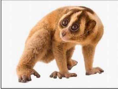
A modern loris species - Perodicticus potto .