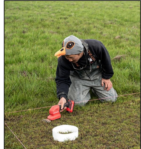
A scientist posing as a goose while they clip grass to mimic grazing.

photosynthesis. This is important because it could change whether this ecosystem is a carbon sink or a carbon source. An ecosystem is called a carbon sink if it absorbs more CO 2 through photosynthesis than it releases through respiration. Alternatively, an ecosystem can be a carbon source if more CO 2 is released than absorbed. We want ecosystems to be carbon sinks because then they keep CO 2 out of the atmosphere, where it contributes to global warming.