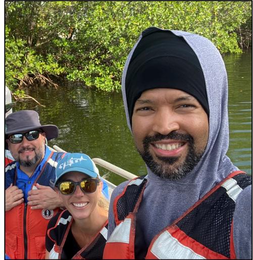
Teachers visiting the mangroves in Miami on a record heat day.