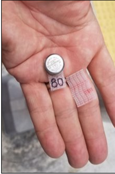
Heat sensor ready to be put out into the city.

temperature when humidity is factored in. With these alerts, people can take action by spending less time outside.