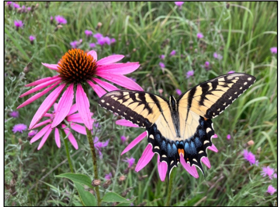
A Tiger Swallowtail butterfly visiting a prairie flower to drink nectar.

Butterflies are insects with colorful wings. You will often see them in a field, flying from flower to flower. Butterflies eat a sugary food made by flowers, called nectar. In return, the butterflies help the plants make seeds by moving pollen. As they travel from flower to flower, pollen is dropped off. This helps plants reproduce and make seeds. This is called pollination, and butterflies are pollinators. We need pollinators to grow many of the fruits and vegetables that we eat!