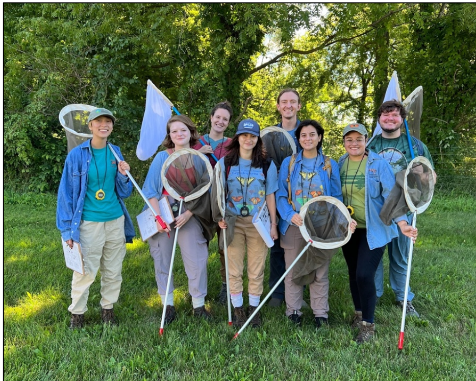
Members of the Haddad Lab, ready to go out for a day of butterfly sampling in the prairie strips!

same time every week. Each time, they counted all the butterflies they saw within 5 meters. Each walk was 12 minutes long and followed a 150-meter path. They did these counts in 6 farm fields without prairie strips and 6 farm fields with prairie strips. The team counted butterflies like this 20 times over the summer. At the end of the summer, they added up all of the butterflies observed in each field. This number is called butterfly abundance .