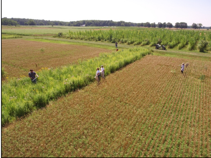
Researchers sampling butterflies and other insects in a prairie strip at the Kellogg Biological Station.

fields. Some of the fields had prairie strips, while others did not. They thought prairie strips would help butterflies by adding habitat for them in farm fields that usually don't have many flowers. They predicted they would see more butterflies in fields that have prairie strips and fewer in fields without these strips.