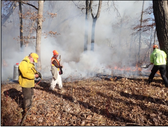
Fire crew in a woodland prescribed fire.

Oaks are considered a keystone species . This means they play a major role in maintaining ecosystem functions and the success of other species. There are two main reasons. First, they produce large amounts of acorns, which are food for many types of wildlife. Second, their canopies have more open spaces that allow light to reach the forest floor. Light is an important resource for plants, and smaller plants are limited by the shade of large trees. More light passing through the canopy allows more plants to grow below the oak trees. This increases the variety of species found.