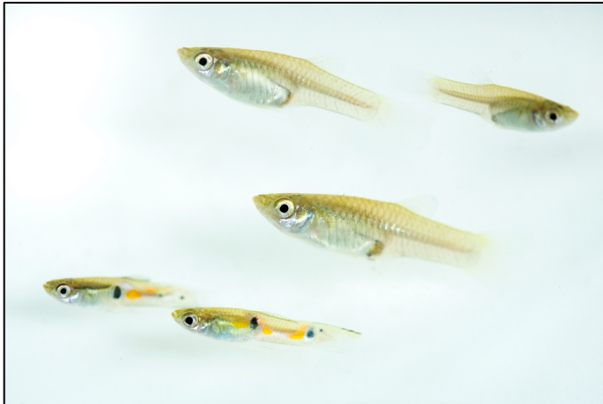
Guppies from Trinidad.