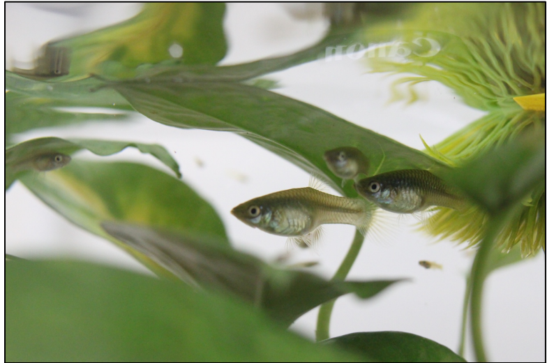
Guppy parents looking for an ideal place to lay their eggs.