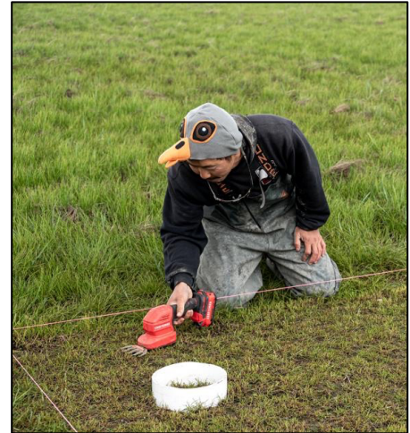
A scientist posing as a goose while they clip grass to mimic grazing.