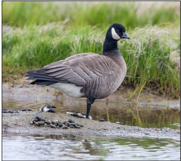
Cackling Goose next to a pile of goose poop, or feces.

With all these geese coming together in one area, they create quite a mess – they drop tons of poop onto the soil. So much poop in fact, that scientists wonder whether poop from this area in Alaska could have a global impact! Climate change is a worldwide environmental issue that is caused by too many greenhouse gasses being released into our atmosphere. Typically, we think of humans as the cause of this greenhouse gas release, but other animals can contribute as well.