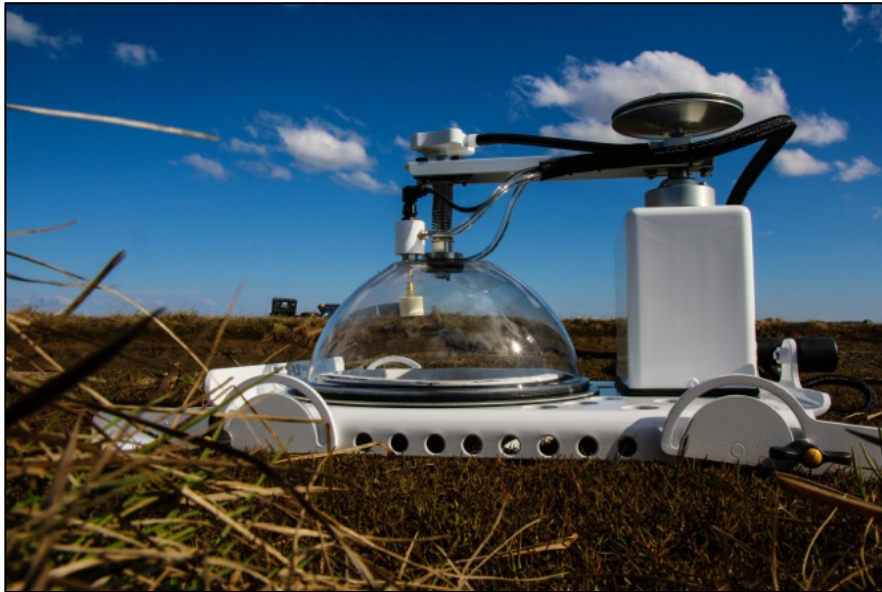
A LICOR Analyzer that measures carbon dioxide and methane emissions from research plots.

Together, the team designed a project to figure out the effects of goose poop on the carbon cycle. For two summers, a large team of researchers spend 90 days camping on remote sites near the Yukon-Kuskokwim Delta. The team scooped up poop from nearby goose habitats to use in their experiments. They set up six control plots where they added no poop and six treatment plots where they added poop. From these twelve plots, the team measured methane emissions from the soil. Methane was measured as methane flux in micromoles, or \mu\text{M} . These data helped them determine how ecosystems respond to geese by measuring whether goose poop affects methane production by soil bacteria.