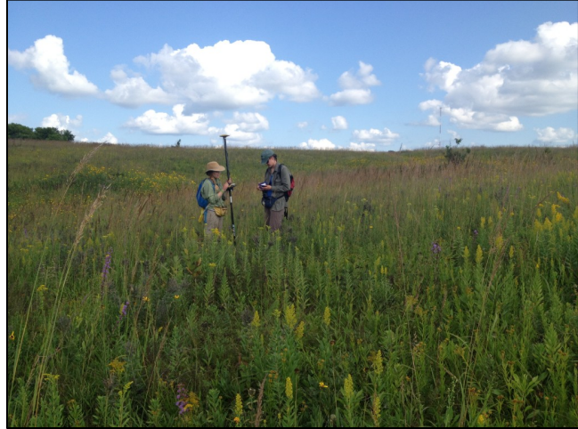
Researchers in the field collecting data on Echinacea .

In 1996, a research team started collecting data on Echinacea plants in a large research site in Minnesota. This prairie site had a schedule for prescribed burns , or controlled fires that are started by experts to manage the land. These burns would happen every 4-6 years during the spring.