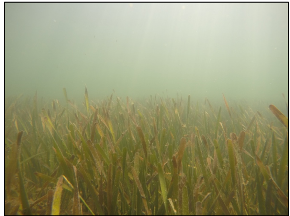
Underwater view of a seagrass meadow.

Seagrasses are a type of plant that grows underwater. They have long, green leaves and form thick underwater meadows. Seagrass meadows have high plant productivity , or growth, which could help offset the effects of climate change. A major driver of climate change is excess carbon in the atmosphere. Plants can help by pulling carbon from the atmosphere during photosynthesis. Because seagrasses have such high productivity, a lot of carbon is stored in the sediment below them.