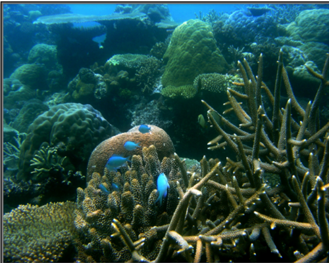
A Pacific coral reef with many corals

Carly is a scientist who wants to study coral bleaching so she can help protect corals and coral reefs. One day while out on the reef, Carly observed an interesting pattern. Corals on one part of a reef were bleaching while corals on another part of the reef stayed healthy. She wanted to know why some corals and their algae still work together when the water is warm, while others do not.