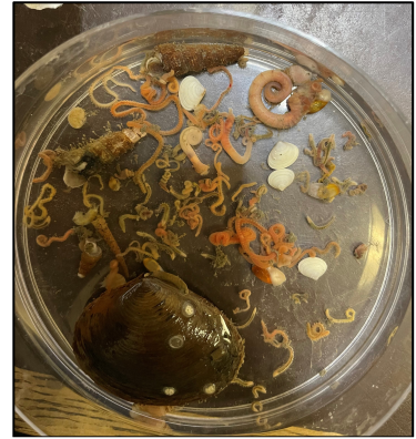
Benthic organisms found in a sediment sample.