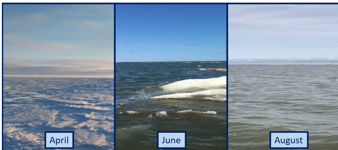
High Arctic lagoons across the seasons

These High Arctic lagoons go through many extreme changes each season. In April, ice completely covers the surface. The mud at the bottom of the shorelines is frozen solid. In June, the ice begins to break up and the muddy bottoms of the lagoons begin to thaw. The melting ice adds freshwater to the lagoons and lowers the salt levels. In August, lagoon temperatures continue to rise until there is only open water and soft mushy sediment.