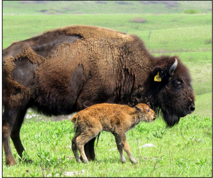
A bison mom and her calf.

The North American Bison is an important species for the prairie ecosystem. They are a keystone species , which means their presence in the ecosystem affects many other species around them. For example, they roll on the ground, creating wallows. Those wallows can fill up with water and create a mini marsh ecosystem, complete with aquatic plants and animals. They also eat certain kinds of food – especially prairie grasses. What bison don't eat are wildflowers, so where bison graze there will be more flowers present than in the areas avoided by bison.