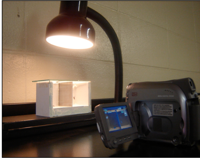
The fighting arena where stalk-eyed flies battle. The camera is set up to help the scientists observe both the high intensity behaviors and retreats.

To prepare the flies for battle, all flies were all starved for 12 hours before the competition to increase their motivation to fight over food. The researchers paired each David with a Goliath in a fighting arena. They observed the flies and recorded aggressive behaviors shown by each opponent. The researchers labeled any behavior where the fighting flies touch each other as a “high intensity behavior”. They labeled any behavior where the flies backed away as a “retreat”. Flies that retreated less than their opponent were declared the winners.