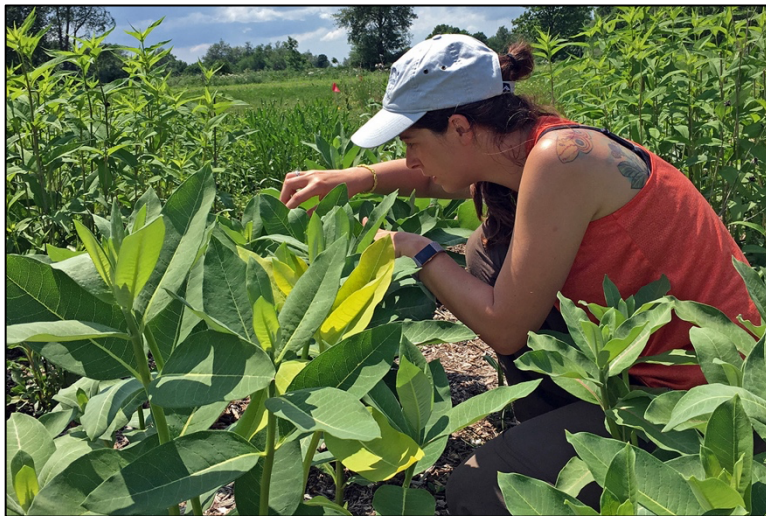
A scientist counting the number of monarch predators on milkweed plants in the experiment.

In Part 1 you explored data that showed monarchs prefer to lay their eggs on young milkweeds that have been mowed, compared to older milkweed plants. But, is milkweed age the only factor that was changed when Britney and Gabe mowed patches of milkweeds? You will now examine whether mowing also affected the presence of monarch predators.