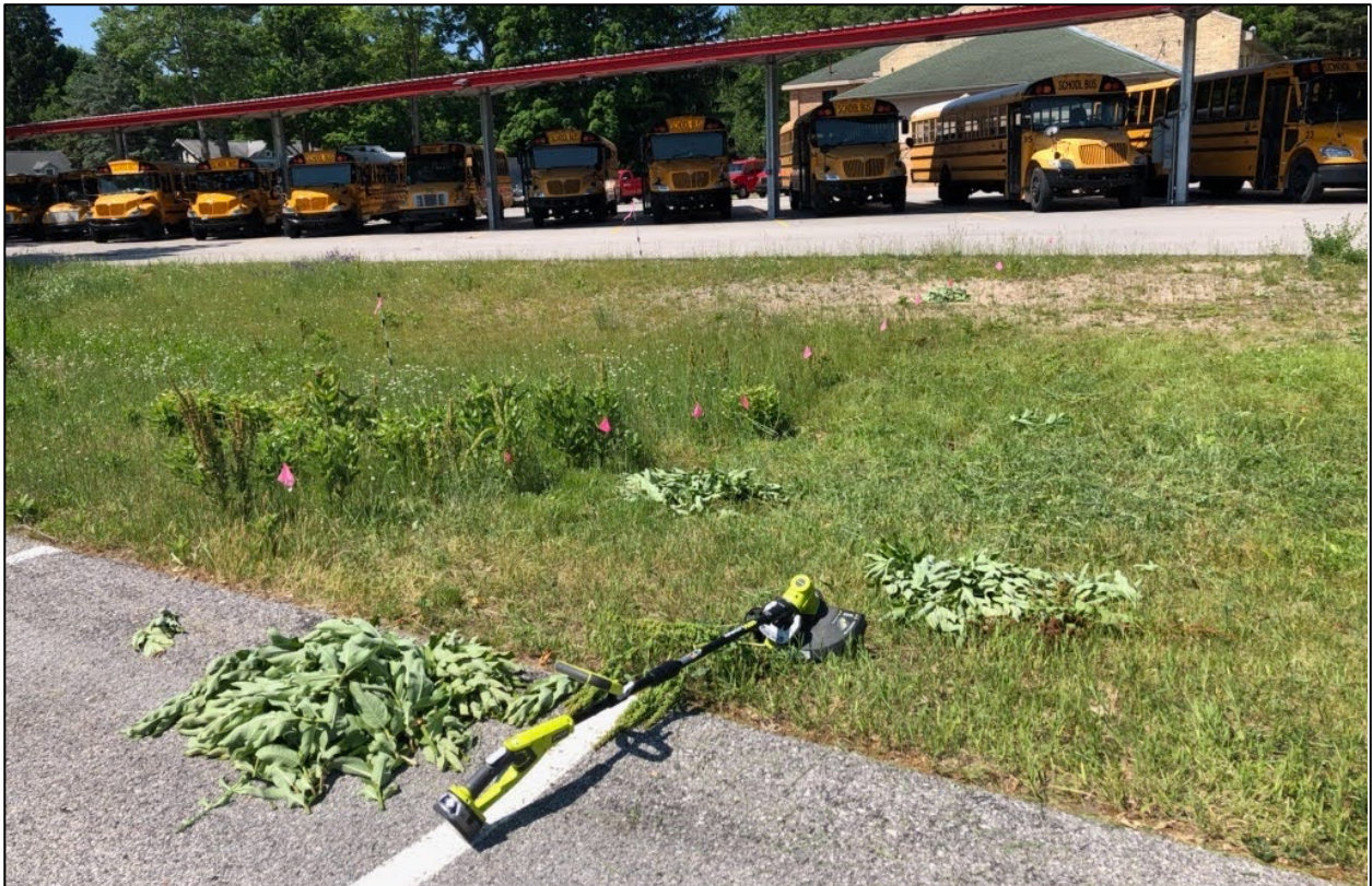
Mowing one of the milkweed patches.

Britney and Gabe chose ten locations for their experiment. In each location they set aside a milkweed patch that was left alone, which they called the control. At the same location they set aside another milkweed patch where they mowed the milkweed plants down. After a while, milkweed plants would grow back in the mowed patches. This means they had control patches with old milkweed plants, and treatment patches with young milkweed plants. Gabe and Britney made weekly observations of all the milkweed patches at each location. They recorded the number of monarch eggs in each of the patches. By the end of the summer, they had made 1,693 observations!