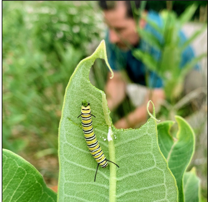
A monarch caterpillar on a milkweed leaf.

With their orange wings outlined with black lines and white dots, monarch butterflies are one of the most recognizable insects in North America. They are known for their seasonal migration when millions of monarch butterflies migrate from the United States and Canada south to Mexico in the fall. Then, in the spring the monarch butterflies migrate back north. Monarch butterflies are pollinators, which means they get their food from the pollen and nectar of flowering plants that they visit. The milkweed plant is one of the most important flowering plants that monarch butterflies depend on.