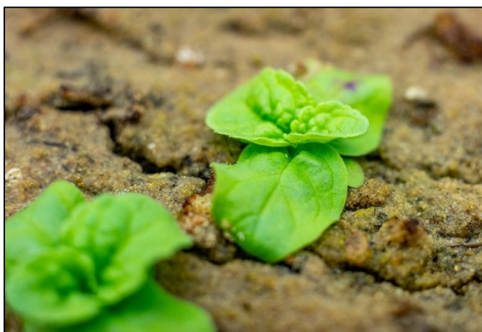
Seeds of Verbascum blattaria germinating in 2021. This is the only species that germinated from the most recent collection.

Scientific Question: How does seed viability change over time?