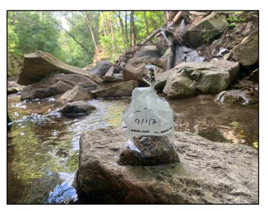
A sediment sample taken at Honey Creek, in Milwaukee WI.

She began to sample sediments from two different rivers in Southeastern Wisconsin. The urban Kinnickinnic River site is in Milwaukee, WI, and the Menomonee River site is in a rural