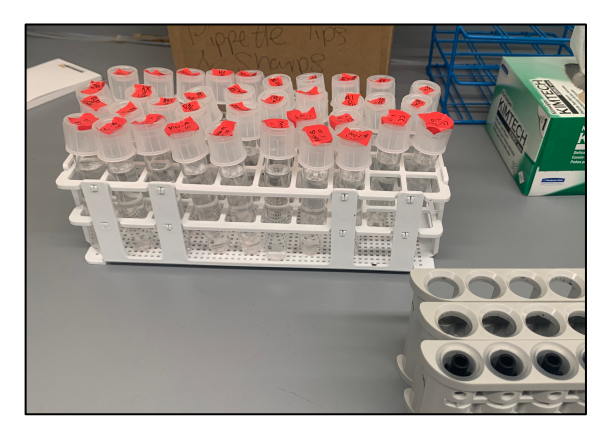
Filtered sediment and water samples ready to be measured for chloride concentration.