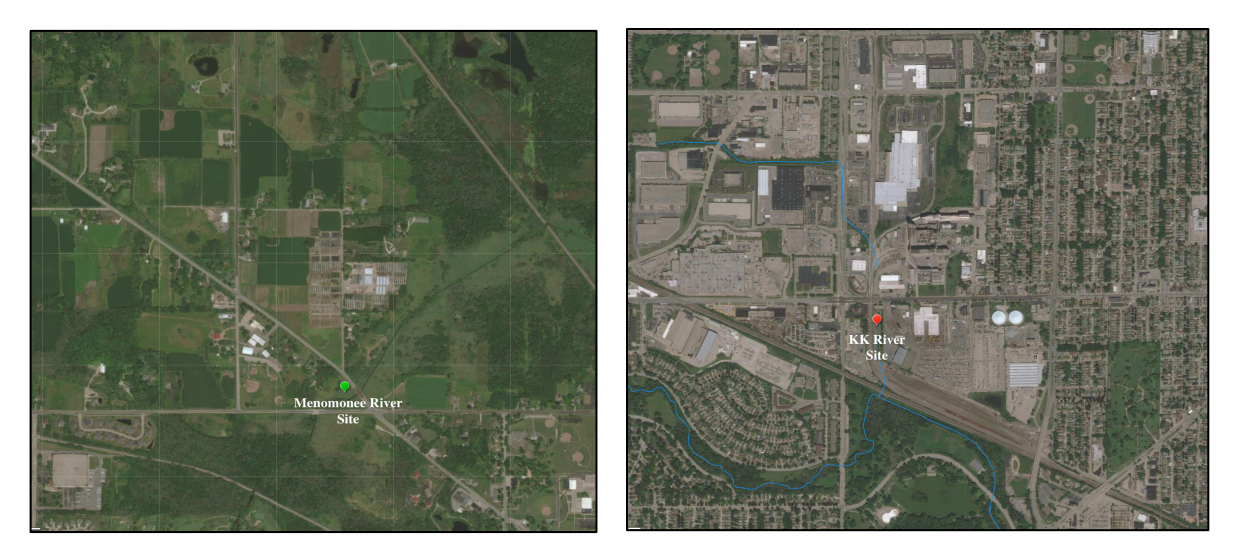
Satellite images of Lexi's field sites: rural Menomonee River Site (left) and urban Kinnickinnic River Site in Milwaukee, (right). Lexi is interested in the halophile communities in these two different environments.

When visiting her sites throughout the year, Lexi collected multiple water and sediment samples. Every time she visited, she also recorded important water quality characteristics such as pH, conductivity, and temperature of the water. She then brought the samples to the laboratory and analyzed each for its chloride concentration. To measure the quantity of halophiles in the sediment, Lexi used a process where the sediment is shaken in water to separate the bacteria from the sediment and suspend them in the water. Samples from the water were then plated on a growth medium that contained a very high salt concentration. Because the growth medium was so salty, Lexi knew that if bacteria colonies grew on the plate, they would most likely be halophiles because most bacteria do not thrive in salty environments. Lexi counted the number of bacteria colonies that grew on the plates for each sample she had collected.