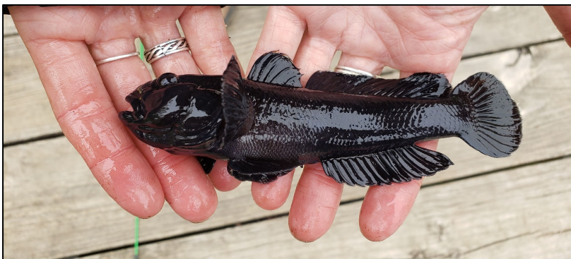
An invasive round goby from the Kalamazoo River, Michigan.

Animals often have adaptations, or traits that help them live in certain environments. For fish, that can mean having a body shape that allows them to feed on available prey, better hide from predators, or swim more effortlessly. When these