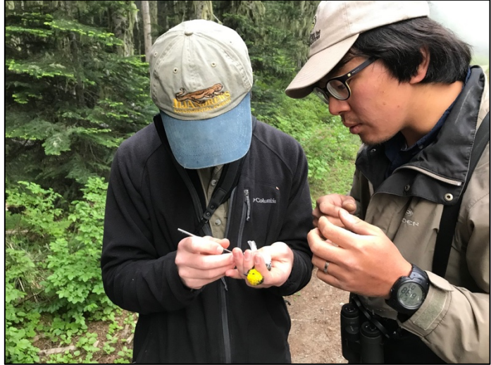
Collecting data on a warbler.