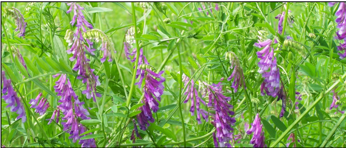
The invasive legume, hairy vetch ( Vicia villosa ), growing in the field.

Yi and Tomomi are scientists who tested this hypothesis using one invasive plant species, hairy vetch. They took soil samples from three different spots based on the invasion history: vetch had never been there (no invasion, 0 years), vetch arrived recently (new invasion, less than 3 years), and vetch invaded a long time ago (old invasion, more than 10 years). These soils had rhizobia in them, each with different histories with hairy vetch. Yi and Tomomi took these soils