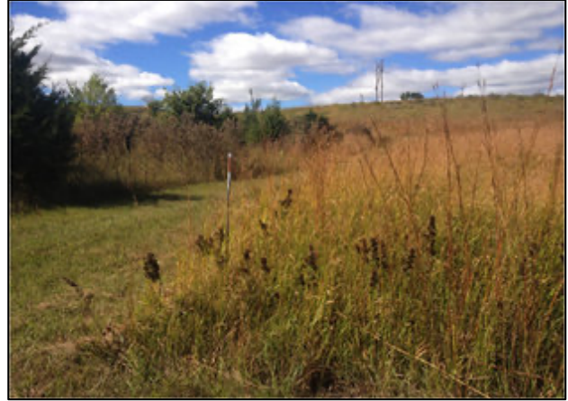
These are two different experimental plots within the large field experiment at Konza Prairie Biological Station. The one with lots of trees is an unburned plot, the one with lots of grass is a burned plot.