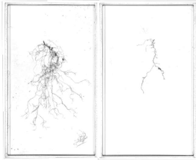
Roots of dot-seed plantain grown in non-serpentine (left) and serpentine (right) soils.

To learn more, she started to read articles about previous research on plants that can only grow in serpentine soils. Alexandria learned that these plant species are generally smaller than closely related species. This was interesting, but she still had questions. She noticed the other experiments had compared plant size in different species, not within one species. She thought the next step would be to look at how plants that are the exact same plant species would respond to serpentine and non-serpentine soil environments. To explore this question, she would need to use serpentine-indifferent plant species because they can grow in serpentine soils and other soils.