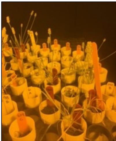
Dot-seed plantain plants in the growth chamber.