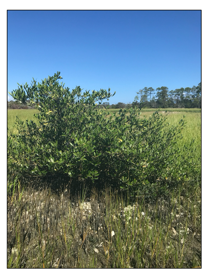
A black mangrove growing in northern Florida.

To each of the 12 plots they applied one of three conditions: control (no extra nutrients), nitrogen added, and phosphorus added. They dug two holes in each plot and added the nutrients using fertilizers, which slowly released into the nearby soil. In the case of control plots, they dug the holes but put the soil back without adding fertilizer.