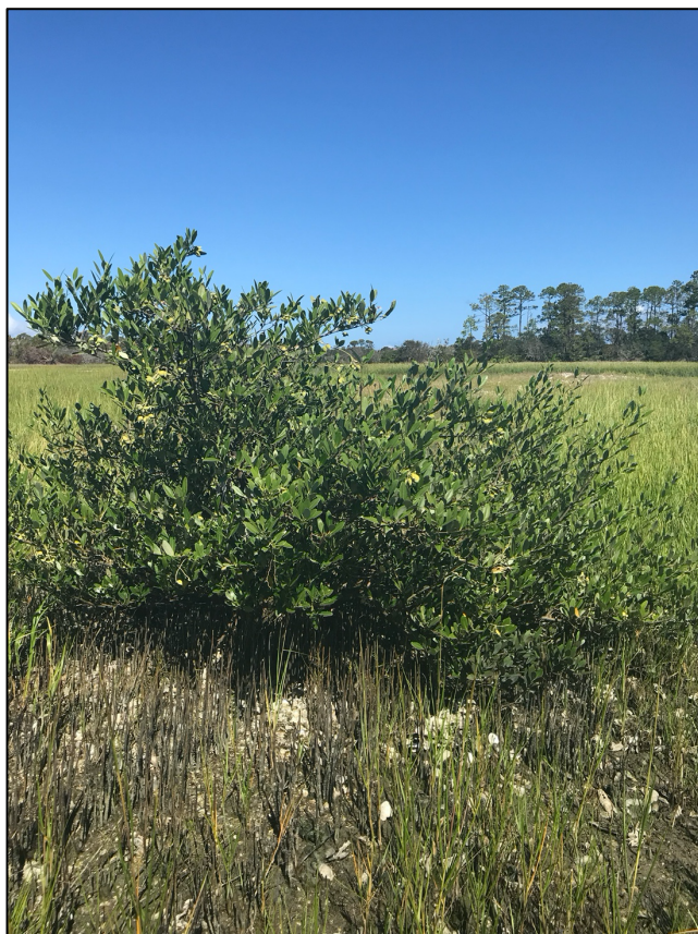
A black mangrove growing in northern Florida.

To each of the 12 plots they applied one of three conditions: control (no extra nutrients), nitrogen added, and phosphorus added. They dug two holes in each plot and added the nutrients using fertilizers, which slowly released into the nearby soil. In the case of control plots, they dug the holes but put the soil back without adding fertilizer.