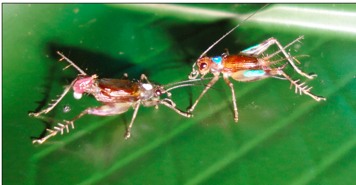
Mating pair of Hawaiian swordtail cricket with macrospermatophore on the male (left). The male and female (right) are marked with paint pens for individual identification.

So why do males give these gifts? There are two main hypotheses explaining why nuptial feeding has evolved in so many different species. First, giving a gift may attract a female and improve a male's chance of getting to mate with her, or of fathering her young. This is known as the mating effort hypothesis . Second, giving a gift may provide the female with the energy and nutrients she needs to produce young. The gift helps the female have more, or healthier, offspring. This is known as the paternal investment hypothesis . These two hypotheses are not mutually exclusive – meaning, for any given species, both mechanisms could be operating, or just one, or neither.