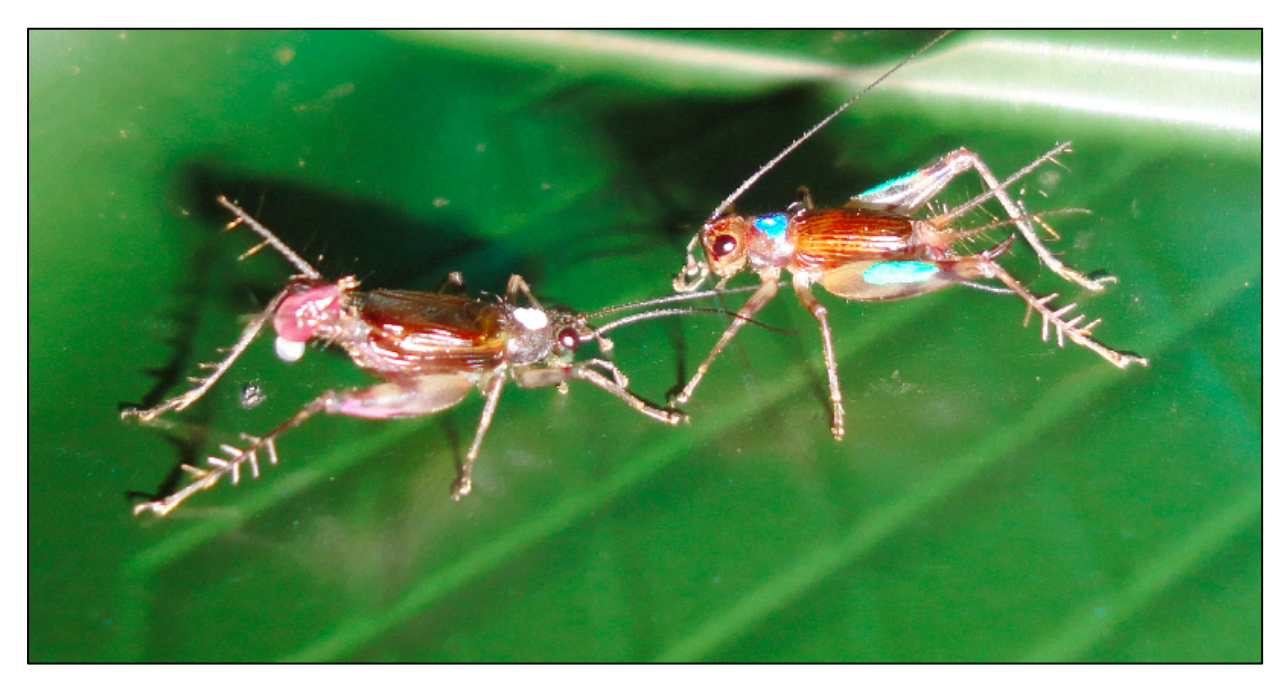
Mating pair of Hawaiian swordtail cricket with macrospermatophore on the male (left). The male and female (right) are marked with paint pens for individual identification.

So why do males give these gifts? There are two main hypotheses explaining why nuptial feeding has evolved in so many different species. First, giving a gift may attract a female and improve a male's chance of getting to mate with her, or of fathering her young. This is known as the mating effort hypothesis . Second, giving a gift may provide the female with the energy and nutrients she needs to produce young. The gift helps the female have more, or healthier, offspring. This is known as the paternal investment hypothesis . These two hypotheses are not mutually exclusive – meaning, for any given species, both mechanisms could be operating, or just one, or neither.