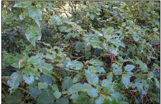
Jaboncillo plants with herbivore damage in Costa Rica

Long before chemists learned how to make medicines in the laboratory, and even long before there were chemists, people found their medicines in plants. To this day, people still extract some medicinal drugs from plants, while others that we used to get from plants are now manufactured in factories.