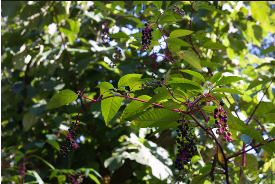
Pokeweed ( Phytolacca americana ) is a common wild plant that grows all over the eastern US. Pokeweed has beautiful pink stems and dark purple berries.

What is the hypothesis? Find the hypothesis in the Research Background and underline it. A hypothesis is a proposed explanation for an observation, which can then be tested with experimentation or other types of studies.