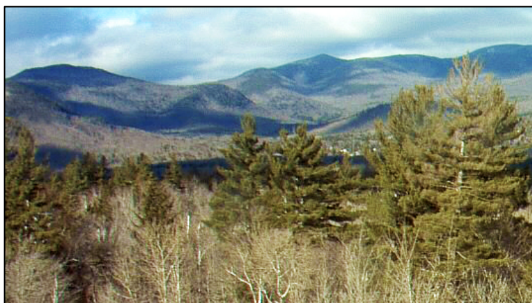
View of the Hubbard Brook Experimental Forest

In Part I, you examined patterns of total bird abundance at Hubbard Brook Experimental Forest. These data showed bird numbers at Hubbard Brook have declined since 1969. Is this true for every species of bird? You will now examine data for four species of birds to see if each of these species follows the same trend.