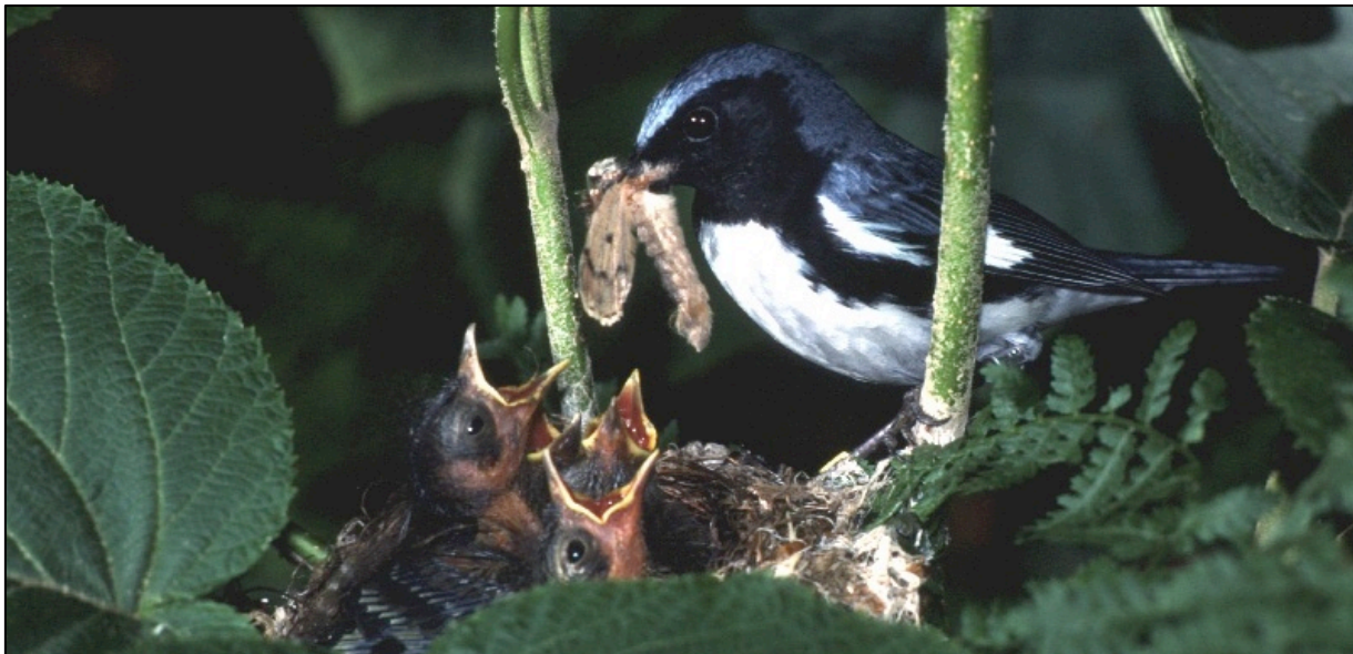
Male Black-throated Blue Warbler feeding nestlings. Nests of this species are built typically less than one meter above ground in a shrub such as hobblebush.