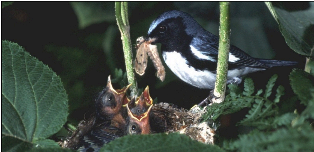
Male Black-throated Blue Warbler feeding nestlings. Nests of this species are built typically less than one meter above ground in a shrub such as hobblebush.