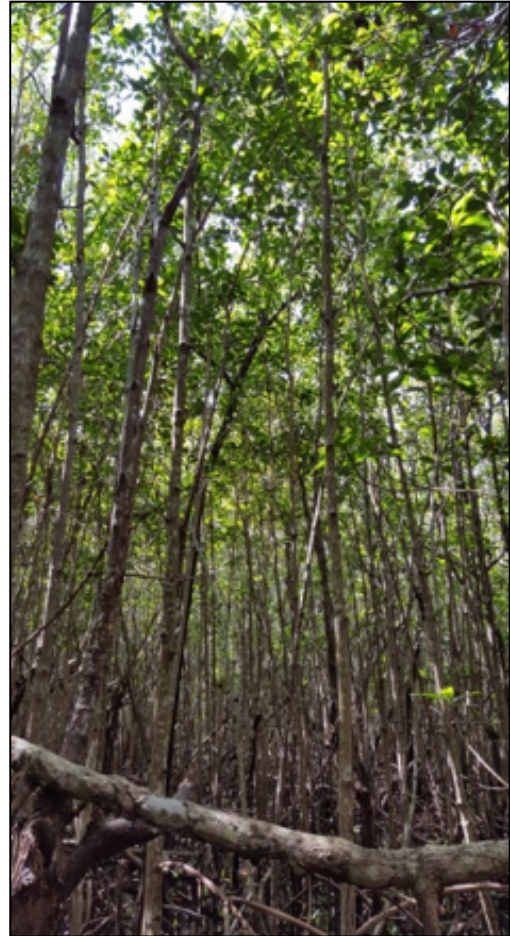
Tall mangroves growing close to the coast.

Once Sean was back in the lab, he quantified how much carbon was in the soil samples from each transect by heating the soil in a furnace at 500 degrees Celsius. Heating soils to this temperature causes all organic matter, which has carbon, to combust. Sean measured the weight of the samples before and after the combustion. The difference in weight can be used to calculate how much organic material combusted during the process, which can be used as an estimate of the carbon that was stored in the soil.