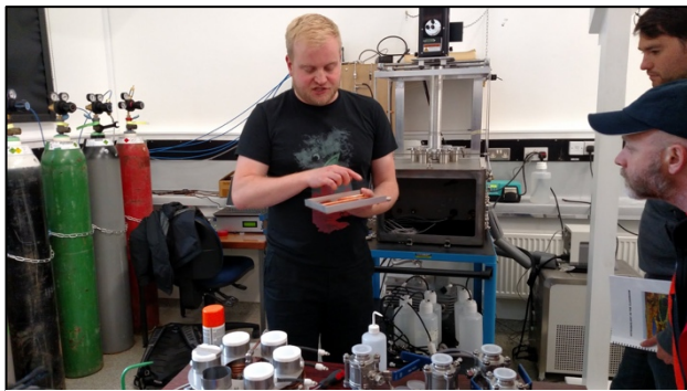
A view of the astrobiology lab.

Is there life on other planets besides Earth? This question is not just for science fiction. Scientists are actively exploring the possibility of life beyond Earth. The field of astrobiology seeks to understand how life in the universe began and evolved, and whether life exists elsewhere. Our own solar system contains a variety of planets and moons. In recent years scientists have also discovered thousands of planets around stars other than our Sun. So far, none of these places are exactly like Earth. Many planets have environments that would be very difficult for life as we know it to survive. However, there are life forms that exist in extreme environments that we can learn from. On Earth there are extremely hot or acidic environments like volcanic hot springs. Organisms also live in extremely cold places like Antarctic glacier ice. Environments with extremely high pressure, like hydrothermal vents on the ocean floor, also support life. If life can inhabit these extreme environments here on Earth, might extreme life forms exist elsewhere in the universe as well?