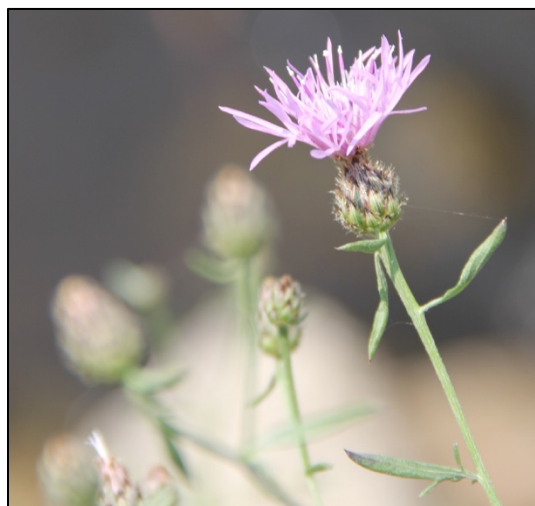
A flower of the invasive plant, Centaurea stoebe (spotted knapweed).