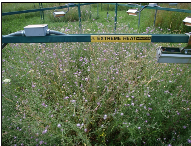
A view of the plants growing in a heated ring. Notice the purple flowers of spotted knapweed.