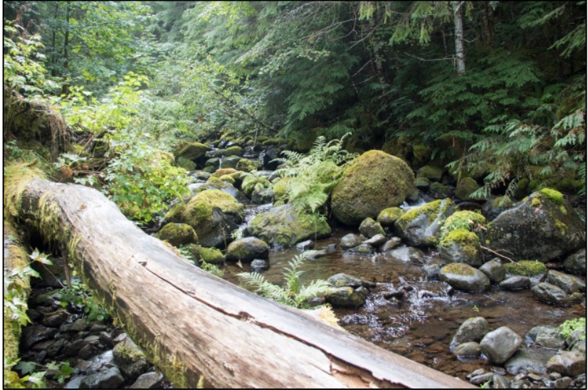
Mack Creek, a healthy stream located within the old growth forests in Oregon. It has a diversity of habitats because of various rocks and logs. This creates diverse habitats for juvenile and adult trout.

Streams are tough places to live. Fish living in streams have to survive droughts, floods, debris flows, falling trees, and cold and warm temperatures. In Oregon, cutthroat trout make streams their home. Cutthroat trout are sensitive to disturbances in the stream, such as pollution and sediment. This means that when trout are present it is a good sign that the stream is healthy.