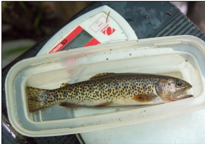
A cutthroat trout. It is momentarily unhappy, because it is not in its natural, cold Pacific Northwest stream habitat.

Scientific Question: What is the effect of major flooding events on adult and juvenile trout populations in Mack Creek?