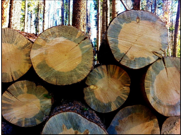
Logs from mountain pine beetle killed lodgepole pine trees. The blue stain fungi is visible around the edge of each log. Mountain pine beetles introduce this fungus to the tree.

Tony thought that the size of the trees in the forest might be related to whether they were attacked and killed by beetles. A larger tree might be easier for a beetle to find and might be a better source of food. To test this idea, Tony and a team of scientists visited many forests in northern Colorado. At each site they recorded the diameter of each tree's trunk, which is a measure of the size of the tree. They also recorded the tree species and whether it was alive or dead. They then used these values to calculate the average tree size and the percent of trees killed for each site.