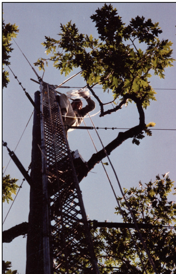
Bill setting up a large metal tower in Harvard Forest in 1989, used to measure long-term CO 2 exchange.

CO 2 concentration of each puff of air that passes by. Bill compares the CO 2 in the air coming from the forest to the ones moving down into the forest from the atmosphere. With the CO 2 data from both directions, Bill calculates the Net Ecosystem Exchange (or NEE for short) . When more carbon is moving into the forest than out, NEE is a negative number because CO 2 is being taken out of the air. This often happens during the summer when trees are getting a lot of light and are therefore photosynthesizing. When more CO 2 is leaving the forest, it means that decomposition and respiration are greater than photosynthesis and the NEE is a positive number. This typically happens at night and in the winter, when trees aren't photosynthesizing but respiration and decomposition still occur. By adding up the NEE of each hour over a whole year, Bill finds the total amount of CO 2 the forest is adding or removing from the atmosphere that year.