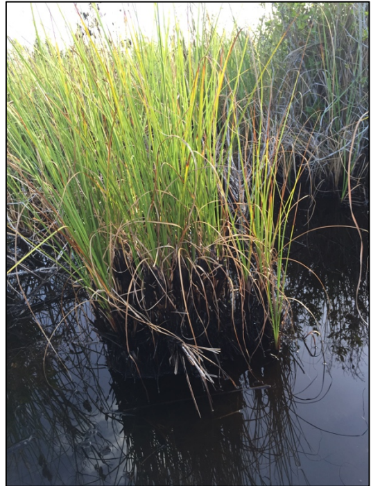
An area in the Florida Everglades where strange soil collapse has been observed.