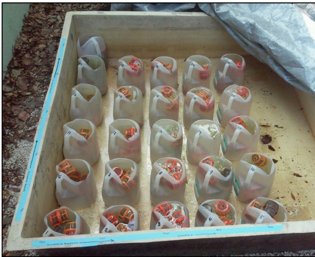
The experimental setup. Each container has a different concentration of phosphorus and salt.

To test their hypotheses, a team of ecologists in John's lab developed an experiment using soils from the Everglades. They collected soil from areas where the soil had collapsed and brought it into the lab. These soils had the microbes from the Everglades in them. Once in the lab, they put their soil and microbes into small vials and exposed them to 5 different concentrations of salt, and 5 different concentrations of phosphorus. The experiment crossed each level of the two treatments. This means they had soil in every possible combination of treatments – some with high salt and low phosphorus, some in low salt and high phosphorus, and so on. Their experiment ran for 5 weeks. At the end of the 5 weeks they measured the amount of CO 2 released from the soils.