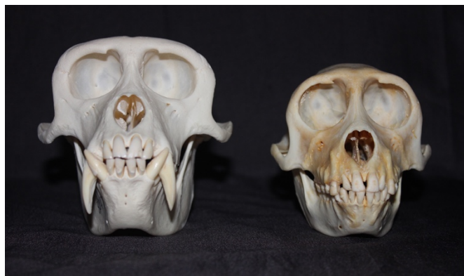
Skeletal specimens of an adult male (left) and an adult female (right) rhesus macaque.

One species that shows strong sexual dimorphism is rhesus macaques. In this species of monkey, males are much larger than females. Cayo Santiago is a small island off the shore of Puerto Rico. On this island lives one of the oldest free-ranging rhesus macaque colonies in the world. This population has no predators and food is plentiful. Scientists at Cayo Santiago have gathered data on these monkeys and their habitat for