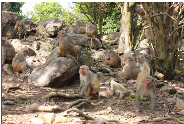
Cayo Santiago rhesus macaques.

It is easy to identify a deer as male when you see his huge antlers, or a peacock as male by his stunning set of colorful tail feathers. But you may wonder, how do these traits come about, and why don't both males and females have them? These extravagant traits are thought to be the result of sexual selection . This process happens when females mate with males that they think have the sexiest traits. These traits get passed on to future male offspring, leading to a change in the selected traits over time. Because females are only choosing these traits in males, sexual selection often leads to sexual dimorphism between males and females. This means that the sexes do not look the same. Often males will be larger and have more elaborate traits than females.