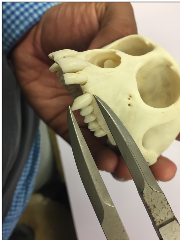
Damián measuring canine length in a rhesus macaque skeletal specimen.

These skeletal specimens can be used by scientists today to ask new and exciting questions. Raisa and Damián are both interested in studying sexual dimorphism in rhesus macaques. They want to find out what causes the differences between the sexes. They chose to focus on the length of the very large canine teeth in male and female macaques. They expected that canine teeth may be under sexual selection in males for two reasons. First, rhesus macaques are mostly vegetarians, so they don't need long canines for the same purpose as other meat-eating species that use them to catch prey. Second, male rhesus macaques often bare their teeth at other males when they are competing for mates. Females could see the long canines as a sign of good genes and may prefer to mate with that trait. Excited by these ideas, Raisa and Damián set out to investigate the museum's skeletal specimens to check whether there is sexual dimorphism in canine length. This is the first step in