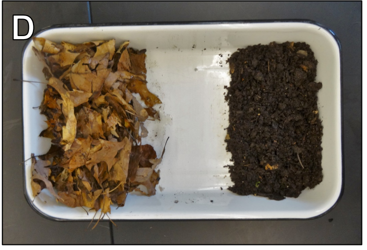
A. Nora collecting woodlice from the compost pile for her experiment, B. Nora measuring a woodlouse with calipers, C. Woodlice in a jar with a moist paper towel for humidity, D. The white tray with light leaves and dark soil habitats.