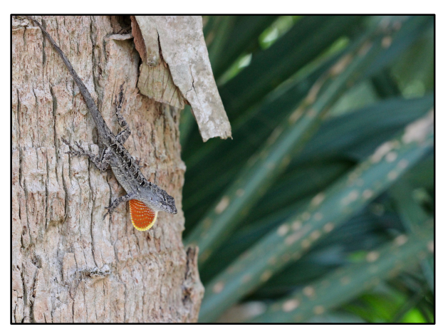
A male anole uses his bright, red dewlap to signal to other anoles.

Natural selection happens when differences in traits within a population give some individuals a better chance of surviving and reproducing than others. Traits that are beneficial are more likely to be passed on to future generations. However, sometimes a trait may be helpful in one context and harmful in another. For example, some animals communicate with other members of their species through visual displays. These signals can be used to defend territories and attract mates, which helps the animal