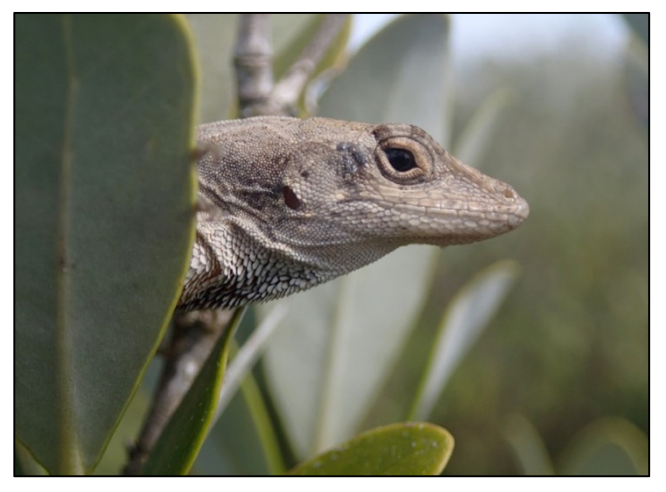
Adult brown anole (Anolis sagrei).

When Charles Darwin talked about the "struggle for existence" he was making the observation that many individuals in the wild don't survive long enough to reach adulthood. Many die before they have the chance to reproduce and pass on their genes to the next generation. Darwin also noted that in every species there is variation in physical traits such as size, color, and shape. Is it simply that those who survive to reproduce are lucky, or do these traits affect which individuals have a greater or lesser