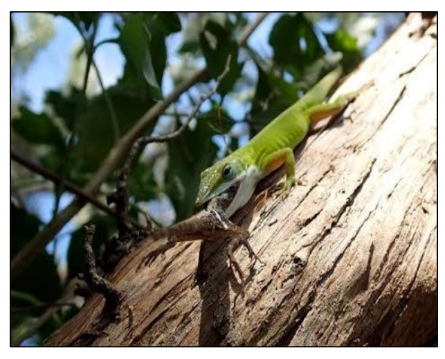
Adult green anole eating a hatchling brown anole.

To test this, Aaron and Robert captured hatchlings in July, assigned a unique identification number to each anole, measured their body length, and then released them back onto the island. In October of the same year, they returned to the island to capture and measure all surviving lizards. They calculated the average percent survival for each size category. Aaron predicted longer individuals would have higher survival. This would indicate that there was natural selection for larger body size in hatchlings.