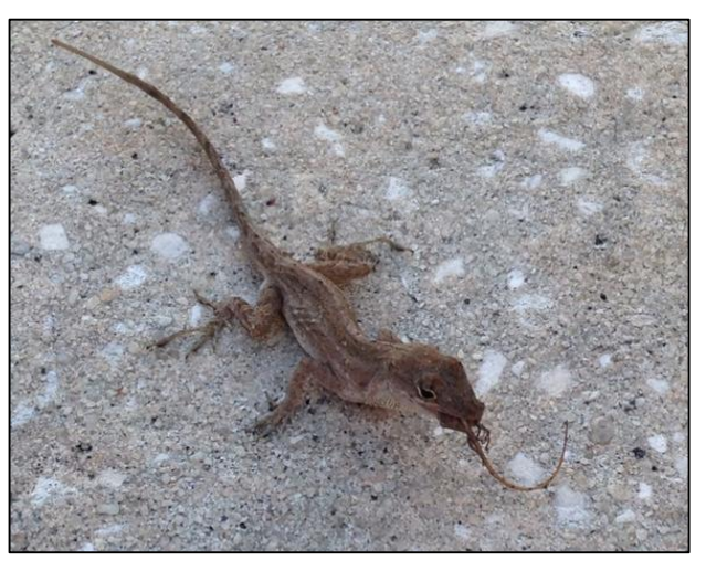
Adult brown anole eating a hatchling brown anole.

<u>Scientific Question</u>: How does the size of a brown anole lizard hatchling affect its chances of survival?