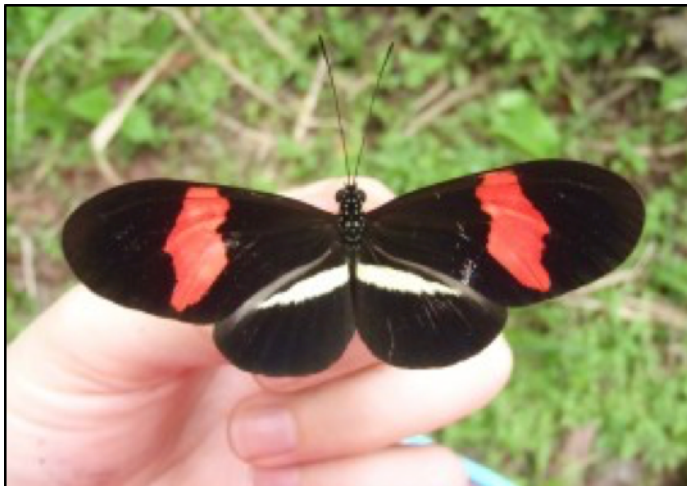
The red postman butterfly, Heliconius erato .

You've probably noticed a bright orange butterfly in your garden. It's hovering over a plant, and then pausing to lay an egg. It's landing on a flower, and then sipping the tasty syrup. Big wings allow butterflies to fly everywhere with ease. But you may wonder, why are their wings so brightly colored? One reason why butterflies might have brightly colored wings is that these colors warn birds and other predators that they would not make a tasty meal.