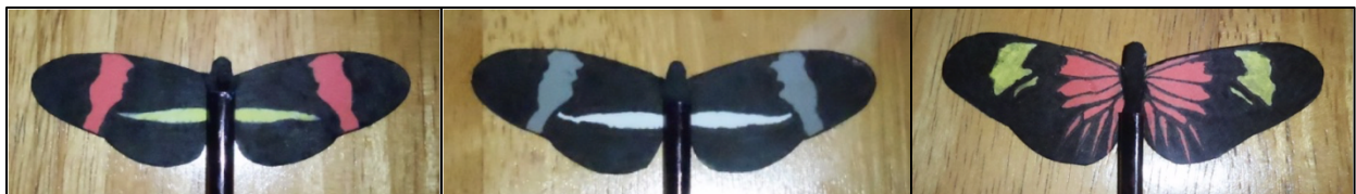
The three model types, A-C. A on the left represents the local color and color pattern of the red postman butterfly. Model B has the local pattern, but has no color. Model C has a non-local pattern but the same colors as model A.