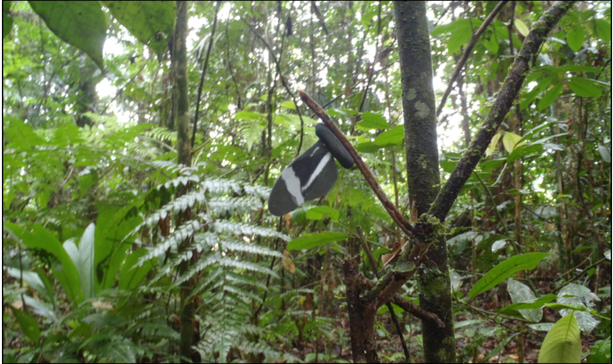
One of the 400 black and white models in the rainforest during the experiment.