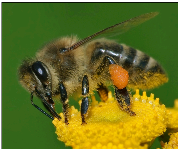
Figure 1: A honey bee ( Apis mellifera ) collecting nectar to bring back to the hive.

Clare chose to look at aggression level as a behavioral trait of individual bees within a colony. She predicted that young honey bees raised in an aggressive colony would be more aggressive as adults, compared to honey bees raised in a less aggressive colony.