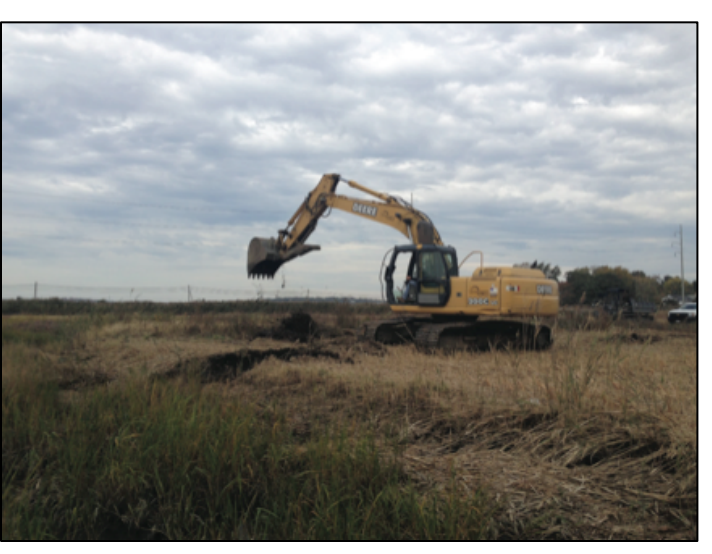
Sometimes heavy machinery is necessary to restore a marsh, like when channels need to be dug to direct water flow. Here, a saltmarsh near Boston, MA is being restored after human disturbance.

Salt marshes are diverse and productive ecosystems, and are found where the land meets the sea. They contain very unique plant species that are able to tolerate flooding during high tide and greater salt levels found in seawater. Healthy salt marshes are filled with many species of native grasses. These grasses provide food and nesting grounds for lots of important animals. They also help remove pollution from the land before it reaches the sea. The grass roots protect the shoreline from erosion during powerful storms. Sadly today, humans have disturbed most of the salt marshes around the world. As salt