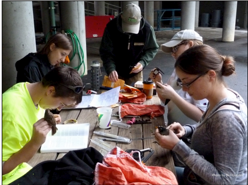
Researchers identify the species of each bird caught in one of the nets used in the study. They then place a metal bracelet on one leg so they will know if they catch the same bird again.